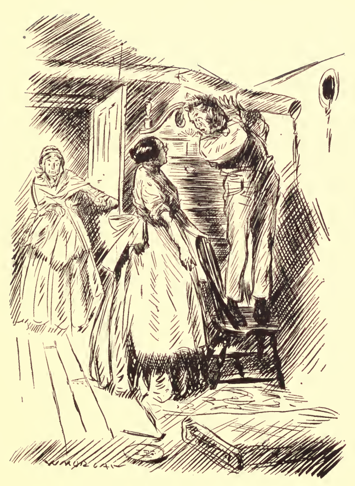
"'You sassy — Get down off that chair and out of this house!""